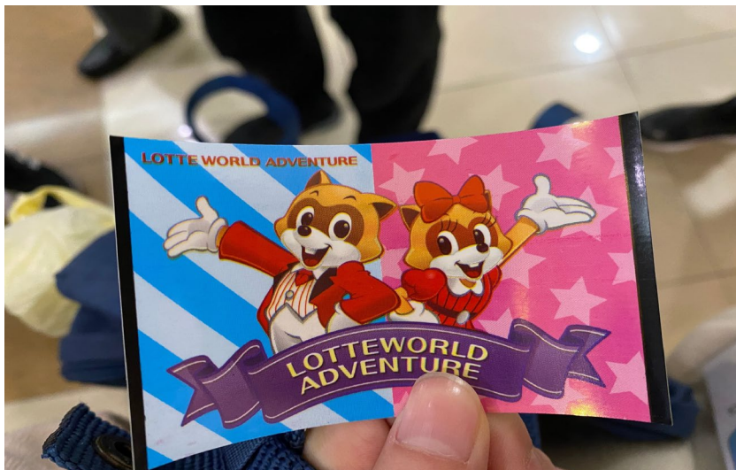
The ticket to Lotte World

In Namiseom, we felt the true freedom and peace. It is calming to take a breath. Lotte World has a special theme which makes it different from the world. You may have a unique experience after you enjoy this fantastic world.