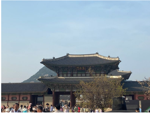
The historical building