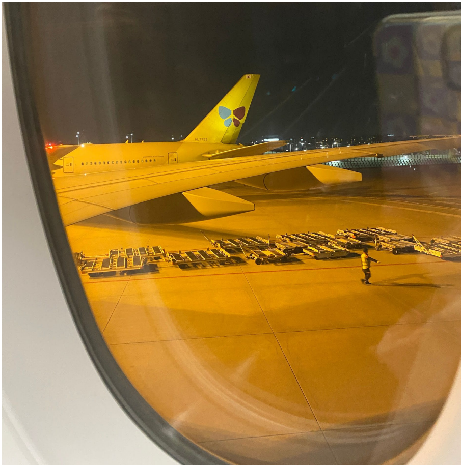
Finally, we went back to Hong Kong.