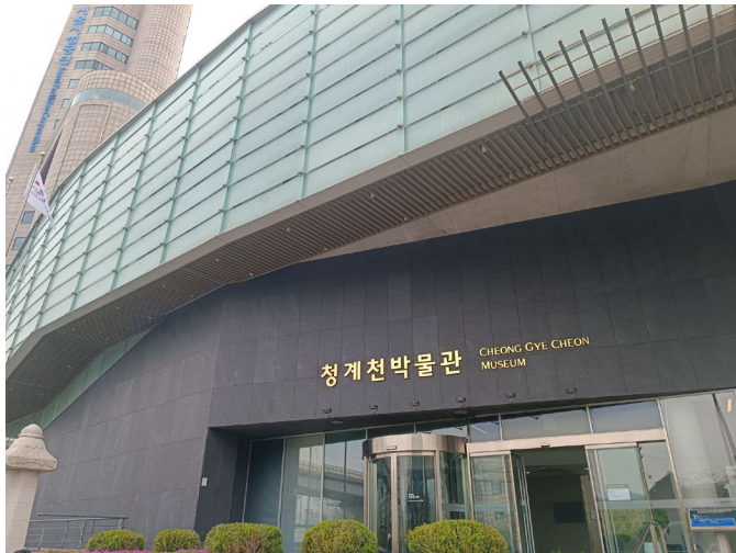
The entrance of the CheongGyeCheon Museum

Our trip has come to an end. In this trip, we have comprehended the history of Korea and know more about the lifestyle of Koreans. It is not only a time for us to play, but also a chance for us to explore Korean culture.