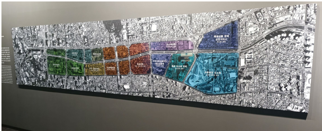
The development of CheongGyeCheon