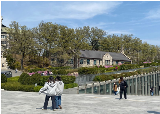
Part of the Ewha Womans University.