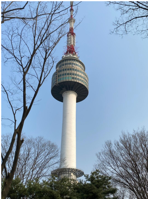
The outline of N Seoul Tower.

Although we walked for a long time and we felt tired, we got a lot of happiness and unforgettable moments.