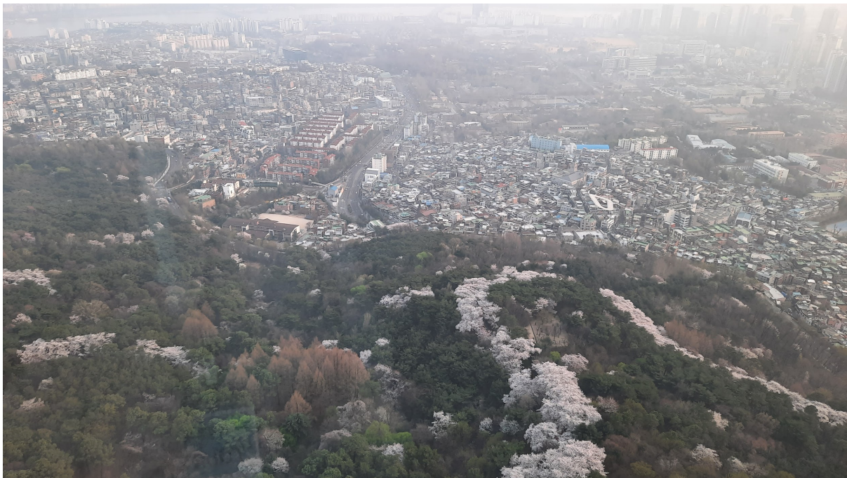
The unbelievable outlook which can be seen on the N Seoul Tower.